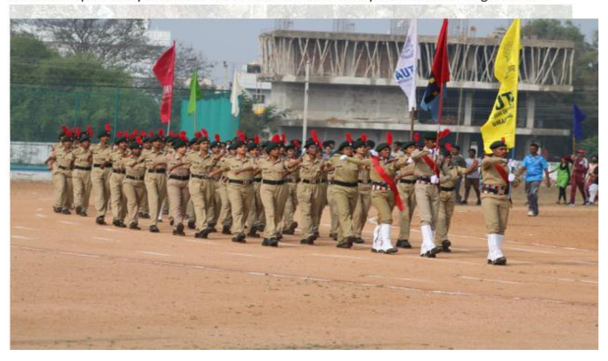
A Gist of Republic day celebrations in the offline mode is represented in the figure below: